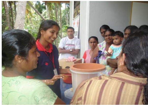
Project Information Officer, Ms. Tharanga conducting CWF usage training for a group of customers

The CWF Project offers extensive consumer support. After the distribution and hygiene promotion events, project staff visit households twice. On the first visit, approximately one week after distribution, staff observe and give advice on how the CWFs have been assembled and located in the houses. During the second visit, approximately four weeks later, project staff carry out a presence/ absence test utilising a UNICEF approved bottled hydrogen sulphide kit. The samples of test water are kept for 24 hours. The presence of bacteria will cause the sample water to turn black, while clean and therefore safe water will remain colourless.