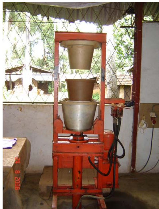
A hydraulic press located at Mr. W. Pothmitiyage's pottery workshop in Kelaniya

At this stage the filter element looks much like an oversized plant pot. However, it is much more than that as its rich husk content makes it ideal for filtering contaminated water. These "green" pots need to be air-dried for 8 -12 days depending on the ambient temperature and humidity.