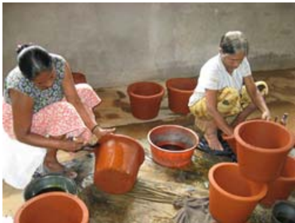
Factory workers inspect the filter pots during production

Quality assurance is emphasized throughout the manufacturing and sales process. These procedures range from the selection of clay and rice husks to flow rate testing, as well as the breaking and inspection of selected pots to assure complete kiln firing. Detailed factory records of the quality assurance tests are kept together with the serial number of each filter, its production and firing dates and the precise filtration rates.