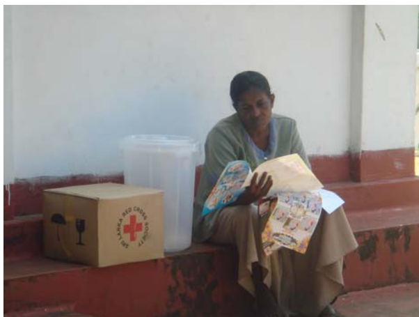
A Beneficiary from Galle studies the Hygiene Promotion literature

The CWF's advantages include its effectiveness, simplicity, portability and affordability. It is economical and requires no recurrent costs by the user. A CWF can filter from 1 - 3 litres of water per hour, enough to meet the drinking water needs of most families. Made mostly with indigenous materials by local potteries the CWF is more environmentally friendly and affordable than most other household safe water methods as they are locally produced.